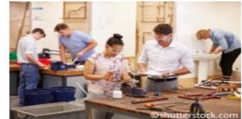
Vocational Education and Training